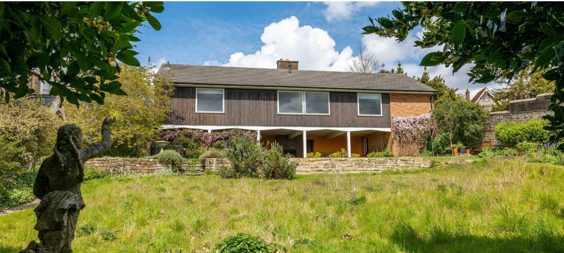
Rotten Row, Lewes