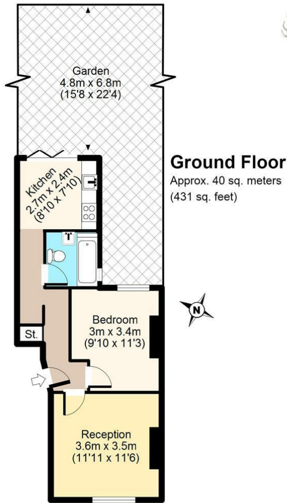
Ground Floor Approx. 40 sq. meters (431 sq. feet)

Total area: approx. 40 sq. meters (431 sq. feet) For illustration purposes only - not to scale