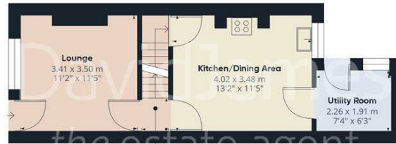
Entrance 0.82 x 0.87 m 2'8" x 2'10"