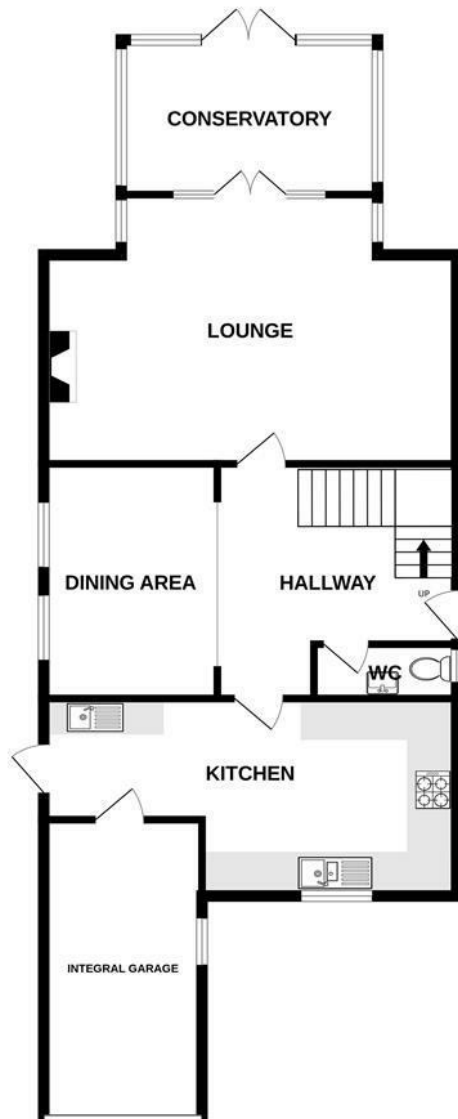
GROUND FLOOR 924 sq.ft. (85.8 sq.m.) approx.