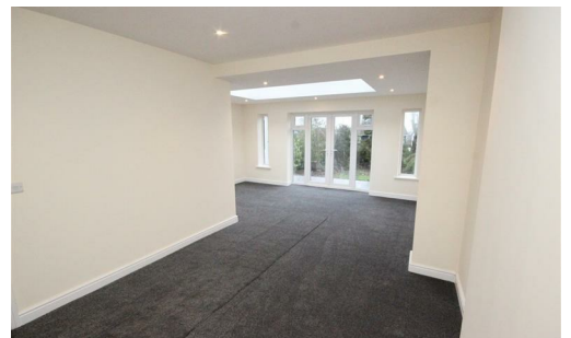
The Nook 86 Dark Lane Halesowen, B62 0PJ