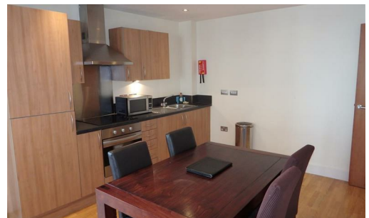
63 The Arcadian Birmingham, B5 4TD