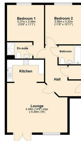
23 Silk Mill Chase, Ripponden, HX6 4BY

Council tax band: B EPC rating: B Deposit: £917