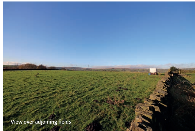
View over adjoining fields

The prices quoted are exclusive of VAT (if applicable).