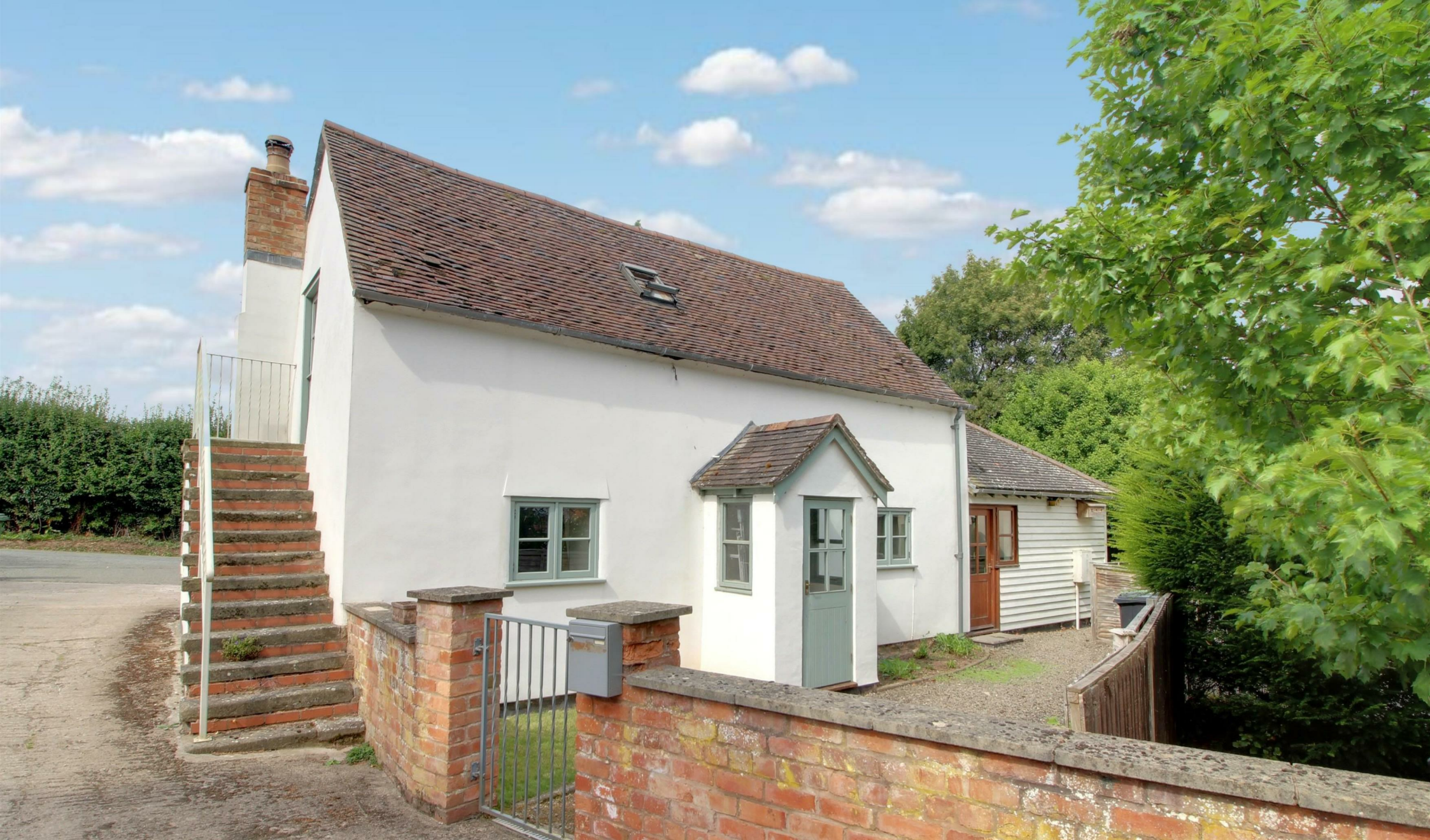
The Haywain Lyne Down, Ledbury HR8 2NT £295,000