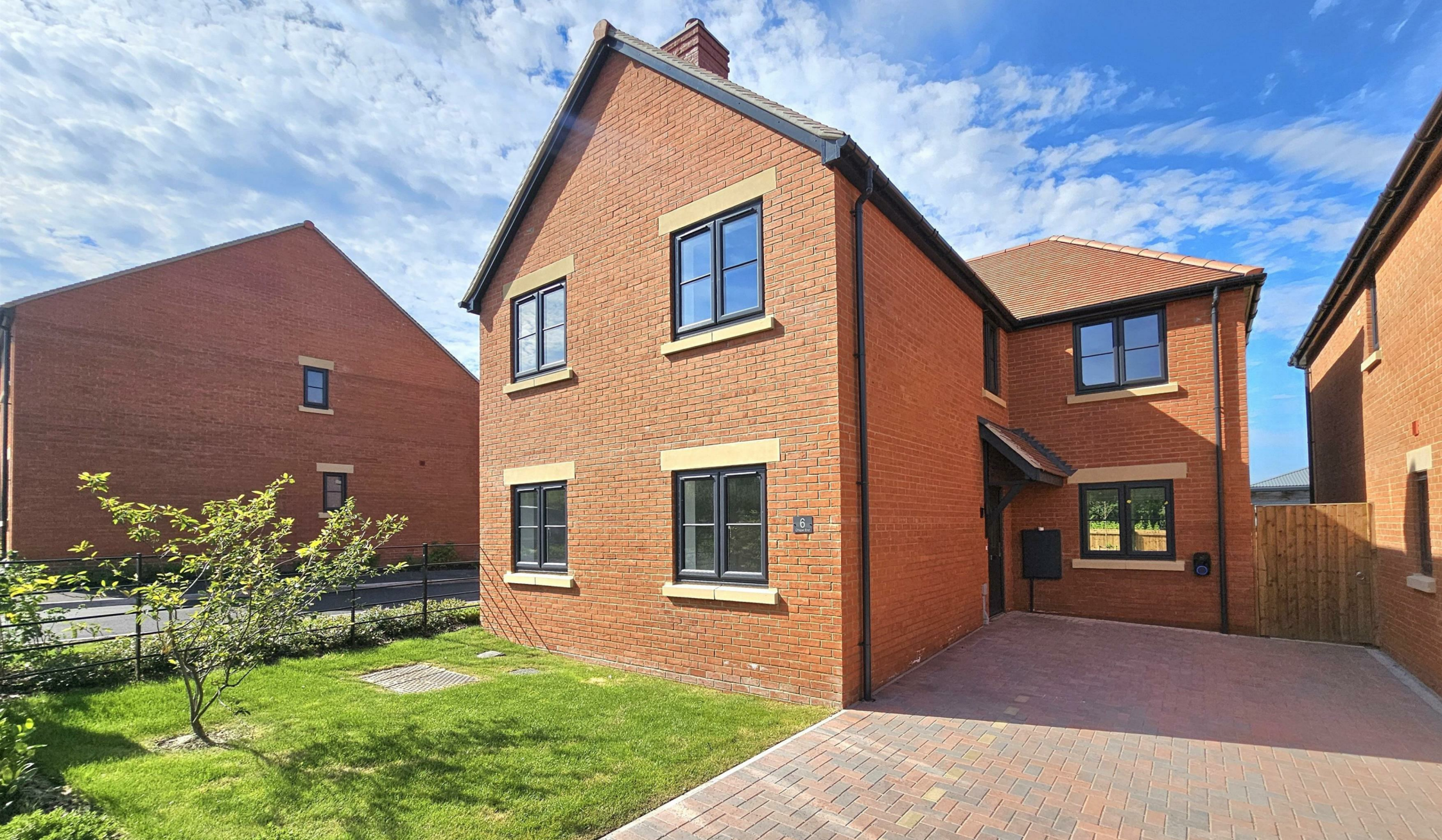
Chapel End, Hartpury GL19 3FH £550,000