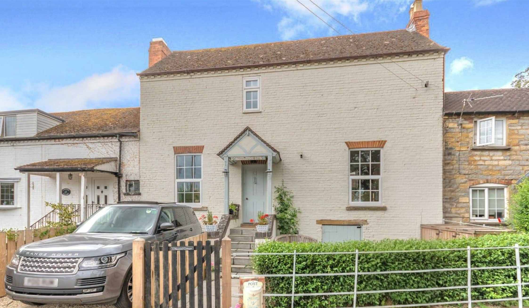
1 Moorend Cottage Moorend, Hartpury GL19 3DG £379,950