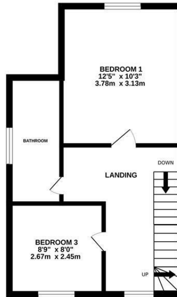
1ST FLOOR 374 sq.ft. (34.7 sq.m.) approx.