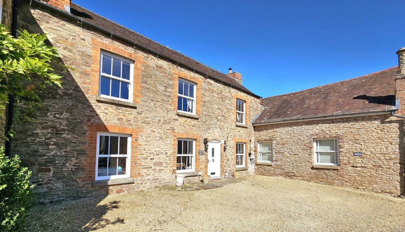
2 Old Vicarage Church Road, Longhope GL17 0LG £475,000