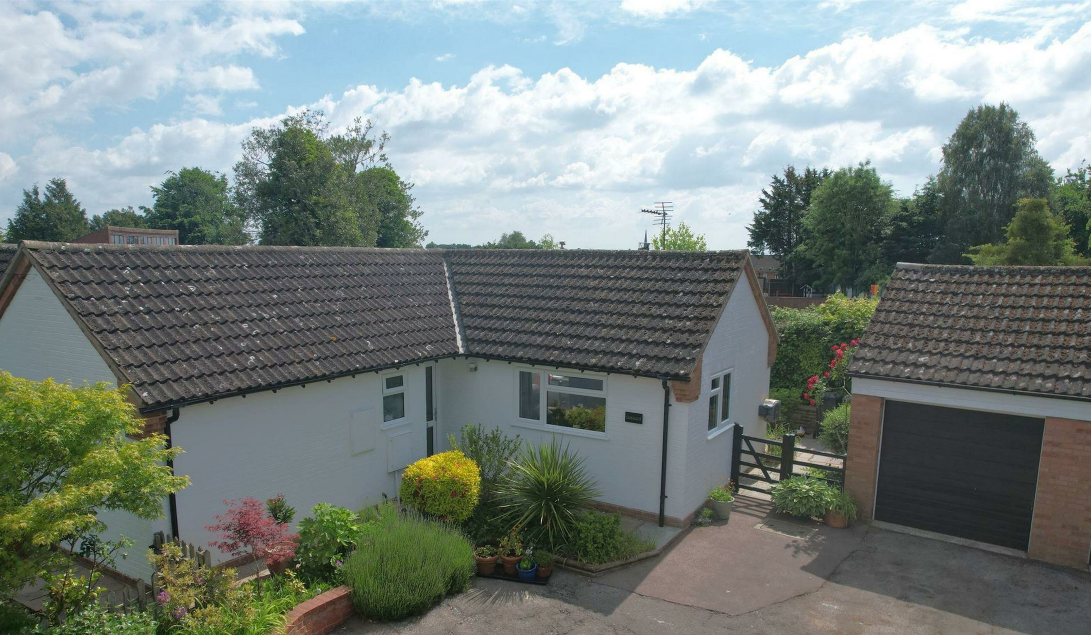
Oakleigh Bradfords Lane, Newent GL18 1QT £439,950