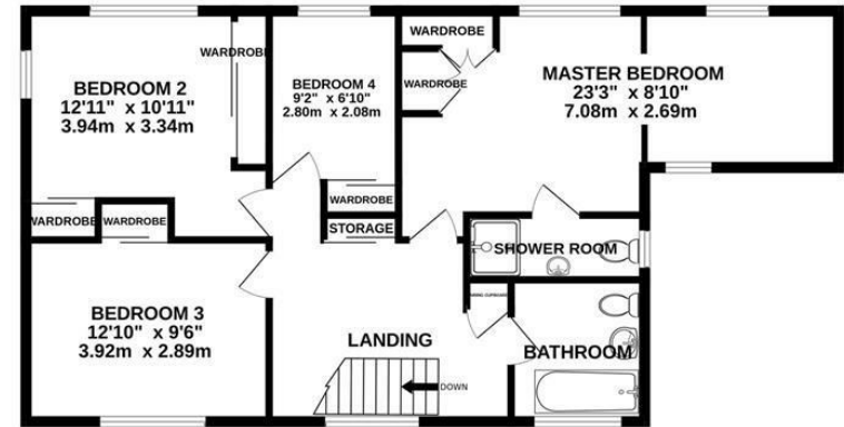
1ST FLOOR 789 sq.ft. (73.3 sq.m.) approx.