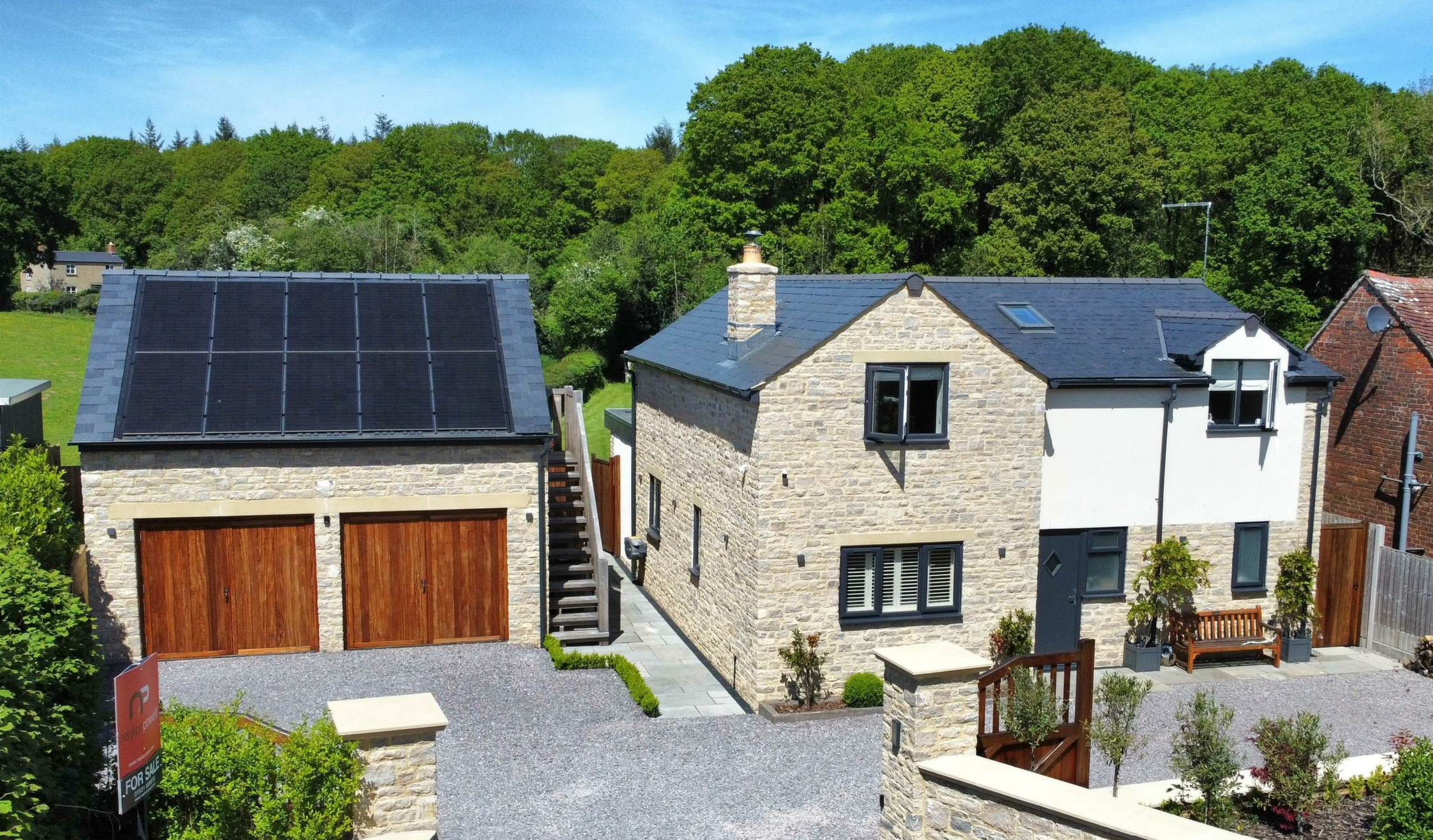
Bay Tree Cottage , Ross-On-Wye HR9 7SL Guide Price £725,000