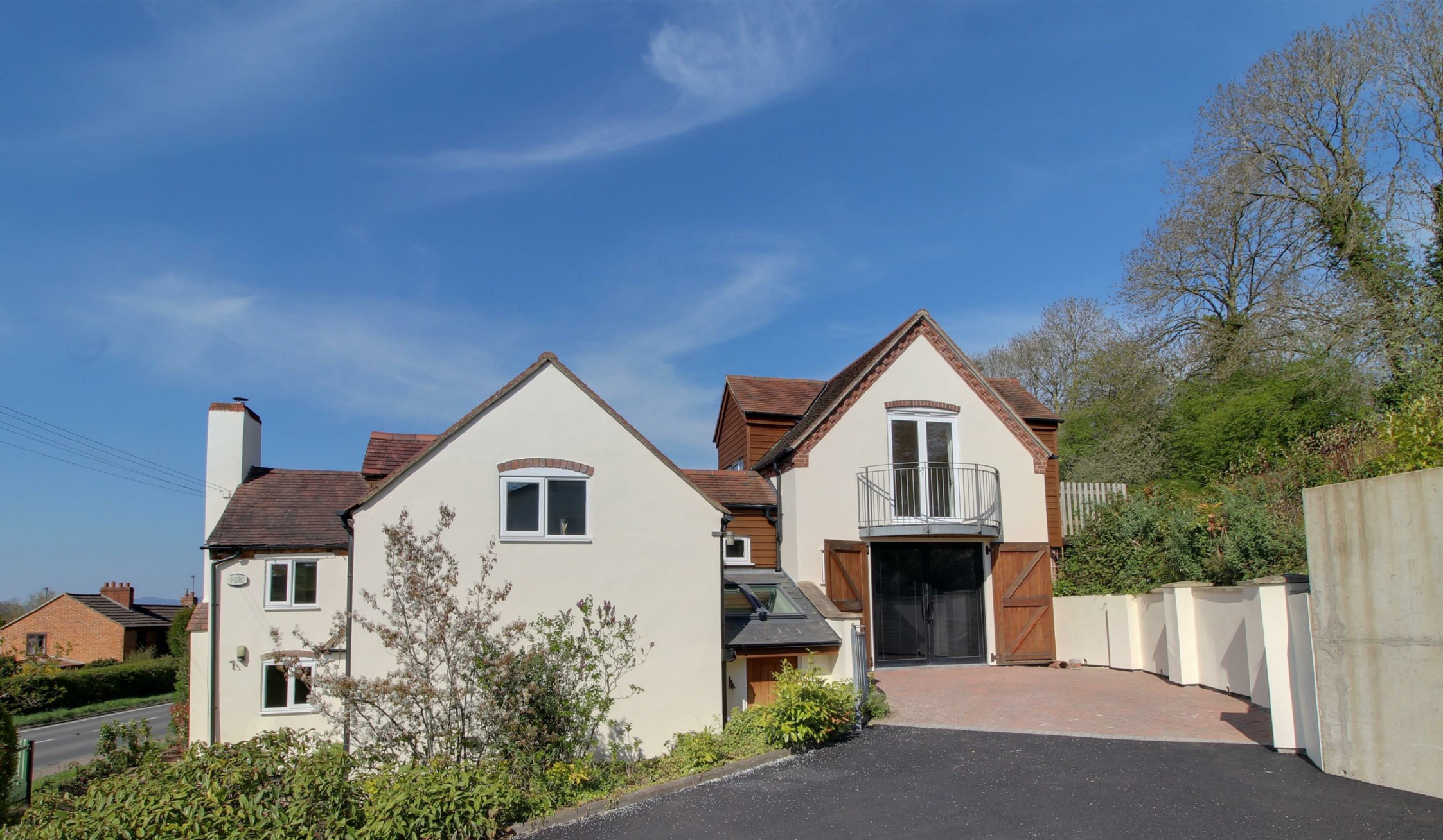
Lilac Cottage Gloucester road, Hartpury GL19 3BT Guide Price £700,000