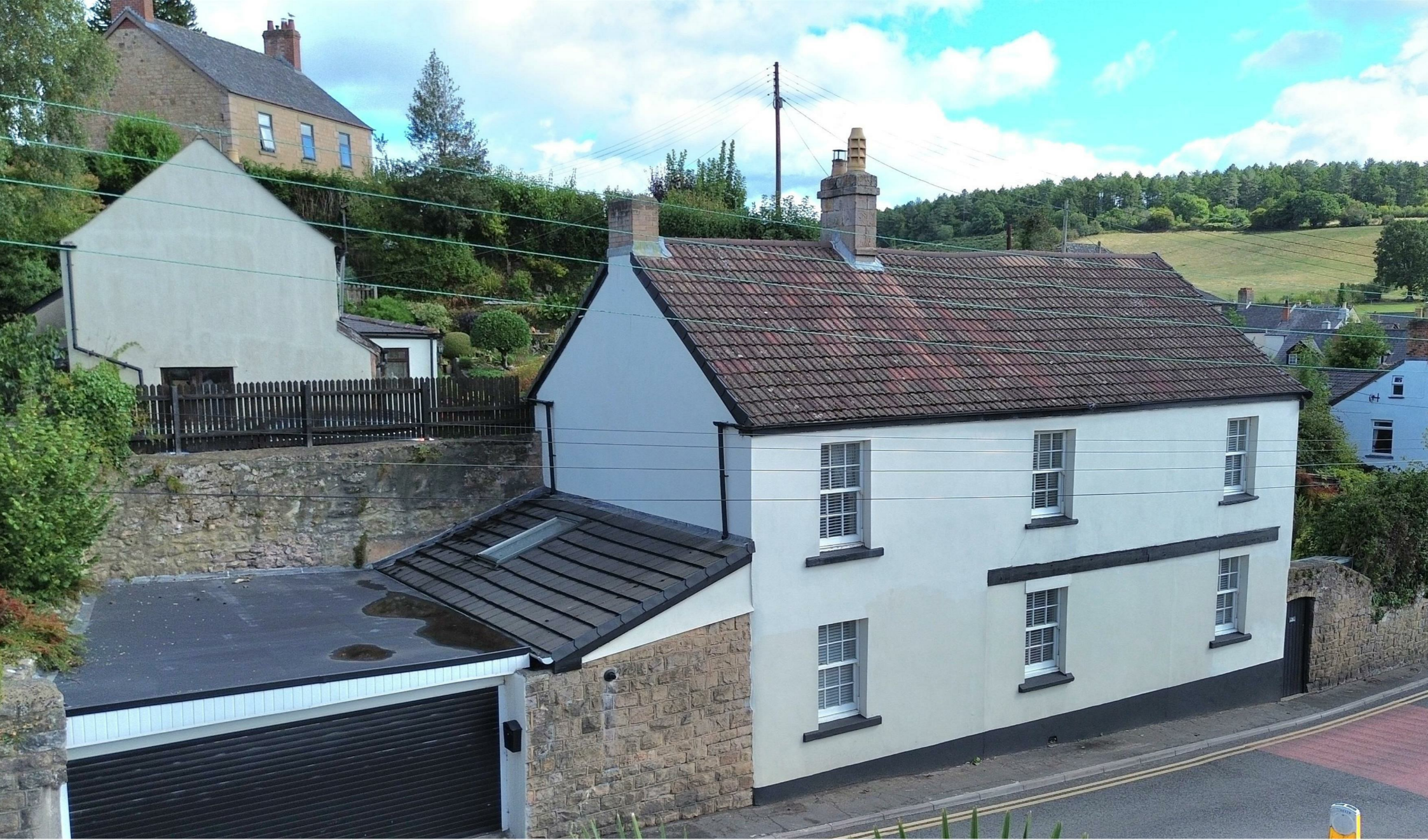
The Beehive Hawthorns Road, Drybrook GL17 9BX £475,000