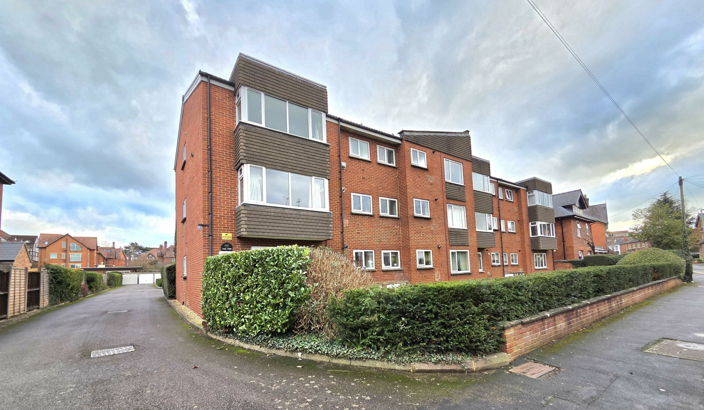
The Firs Heathville Road, Gloucester GL1 3EW £155,000