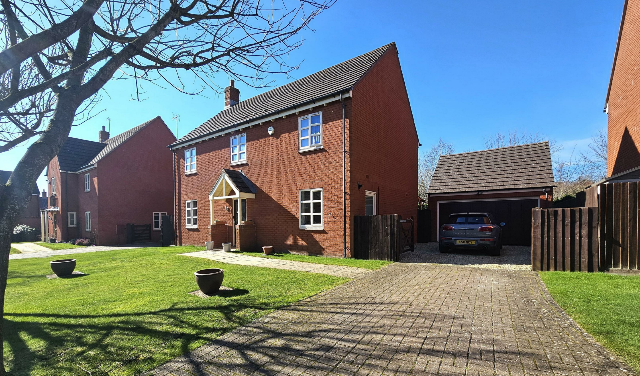
The Anchorage, Hempsted GL2 5JW £620,000