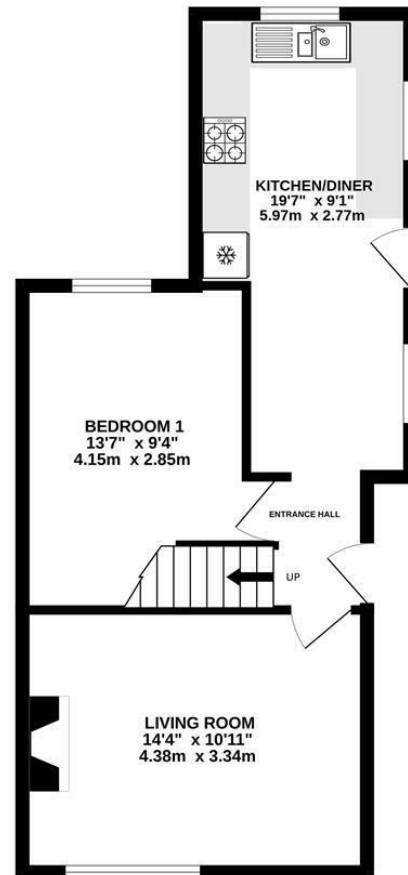
GROUND FLOOR 461 sq.ft. (42.9 sq.m.) approx.