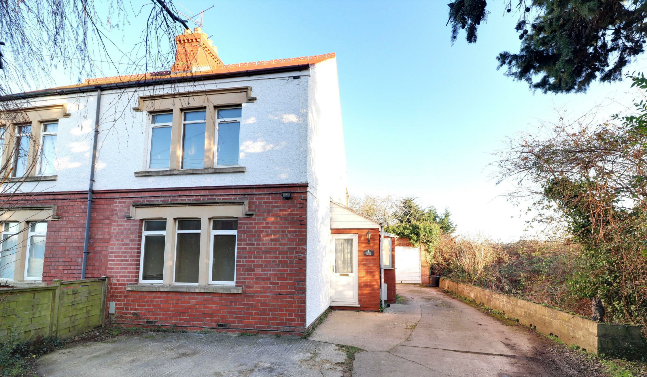
Gable Villas, Moreton Valence GL2 7ND £336,000