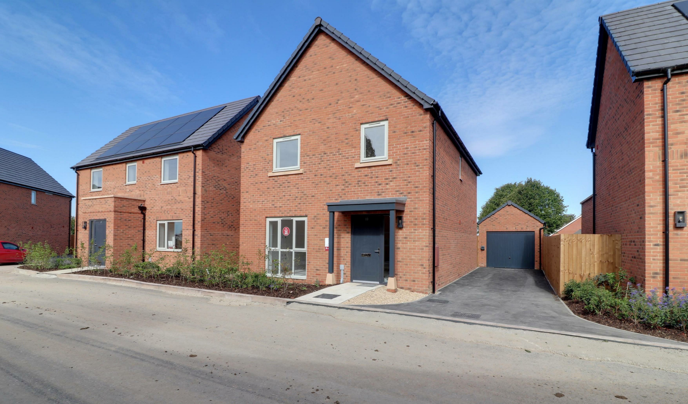
The Prestbury, Upton's Garden, Whitminster, GL2 7LP £595,000