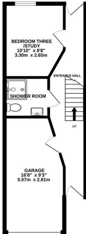
GROUND FLOOR 368 sq.ft. (34.2 sq.m.) approx.