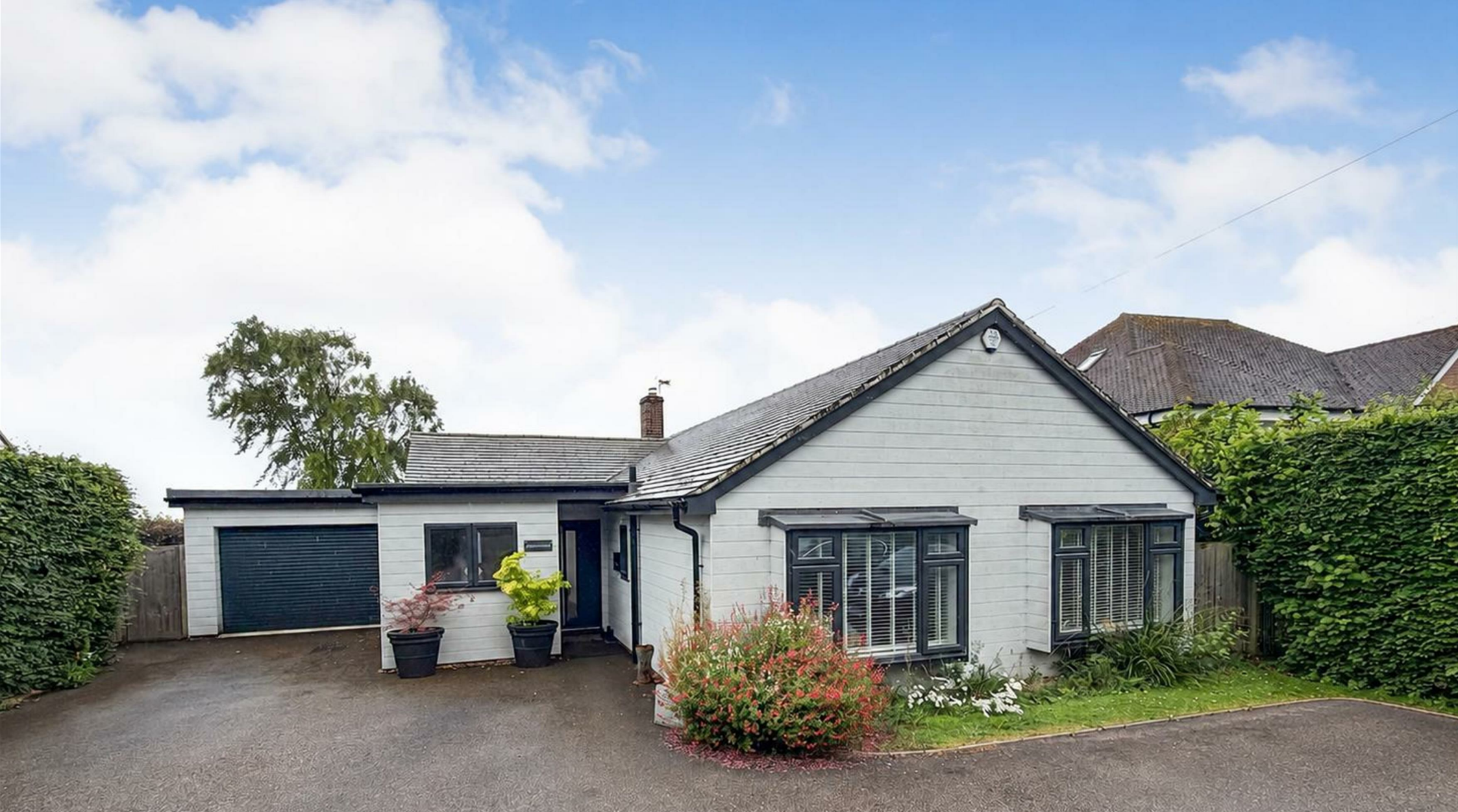
Chart Road, Sutton Valence, Maidstone, ME17 3AW Asking Price £1,000,000

COLES TOWN & COUNTRY VALUERS • LETTINGS & ESTATE AGENTS